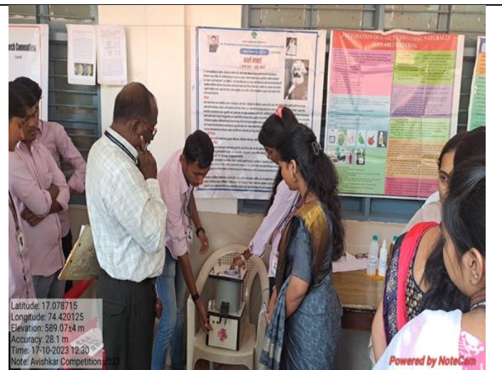
Examiners when examining the working model